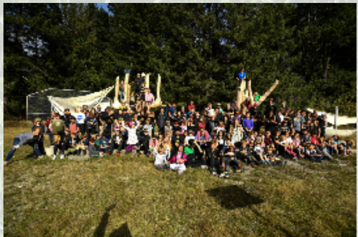
Our children with their Shawnigan Lake School Grade 9 buddies - Friday, Sept. 20

(on behalf of the staff at Mill Bay Nature School)